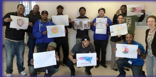
- Streetworkers/Boston Center for Youth & Families -