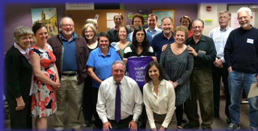
- Facilitation for Groups in Conflict -