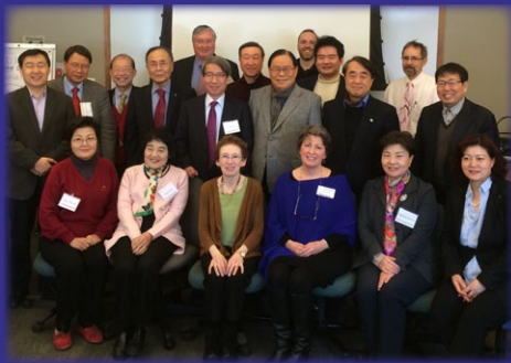
- Visiting Dignitaries from South Korea -