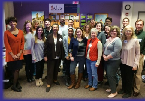
- Basic Mediation Training Fall 2014 -