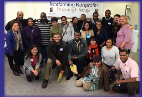
- Heading Home -