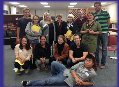
- Belmont After School Enrichment Collaborative -