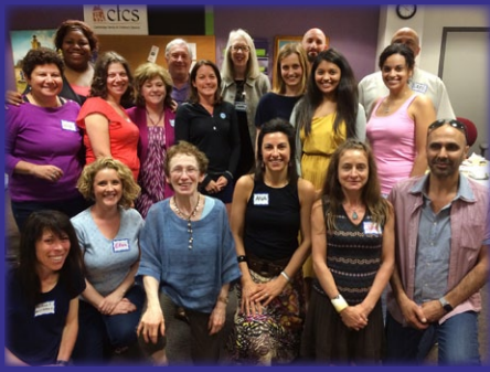
- Divorce Mediation Training Spring 2015 -