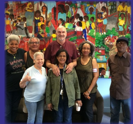
- Tenant Assistance Program, Madison Park -