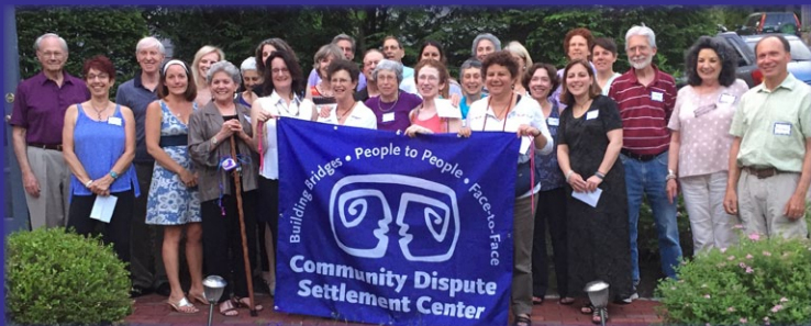
- CDS Center Volunteer Appreciation -