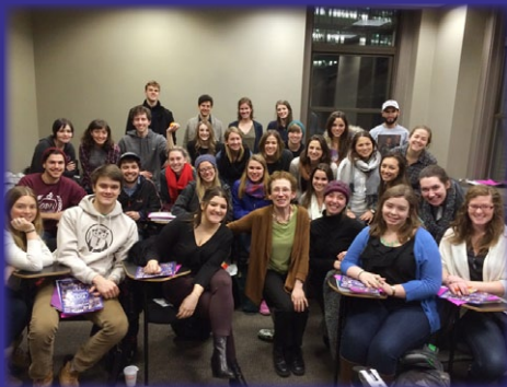
- Emerson College -