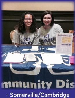
- Somerville/Cambridge Elder Fair -