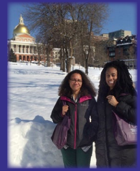
- Legislative Advocacy -