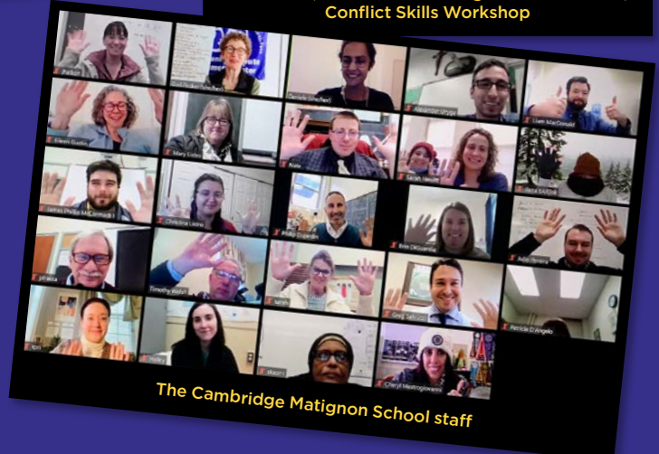
The Cambridge Matignon School staff