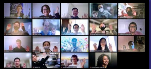
MIT REFS (Resource for Easing Friction & Stress) Conflict Skills Workshop