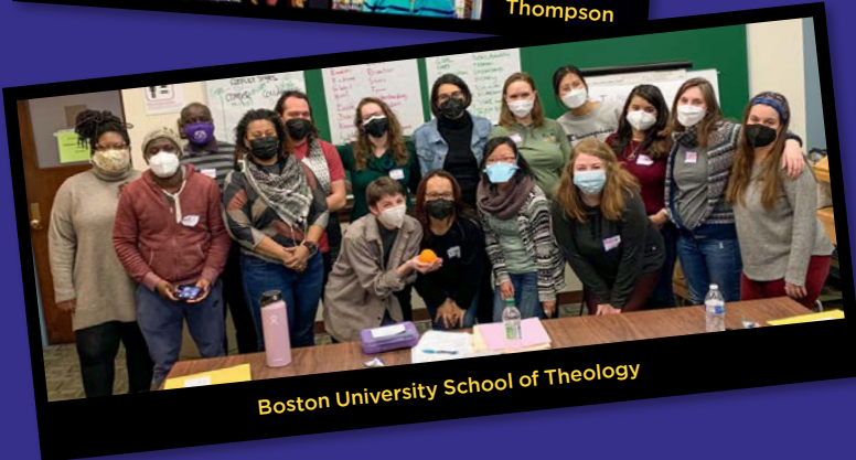
Boston University School of Theology