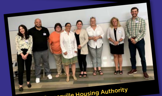
Somerville Housing Authority