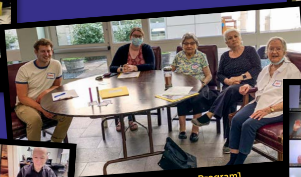
TAP [Tenant Assistance Program] Watertown Housing Authority