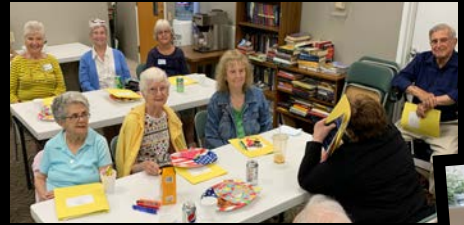
TAP [Tenant Assistance Program] Hingham/Lincoln School Apts